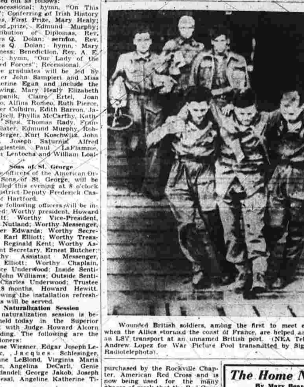
Wounded British soldiers, among the first to meet enemy fire when the Allies stormed the coast in British port.